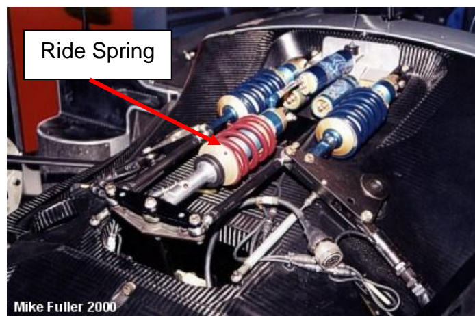
Figure 14. Pitch Spring Misconception

Before going into detail, some common confusion about what a pitch spring is needs to be cleared up- you do not want to analyze pitch damping and apply it to the wrong spring. As shown in the third Spring & Damper tech tip, below in Figure 14 is a picture of a car with two single wheel springs, one roll spring (the anti-roll bar), and one RIDE spring. The ride spring in the middle is commonly incorrectly referred to as a pitch spring. It controls ride stiffness on the front of the car- but coincidentally also operates in pitch. A pitch spring controls the relative ride height between the front and rear of the car- and they are rare.